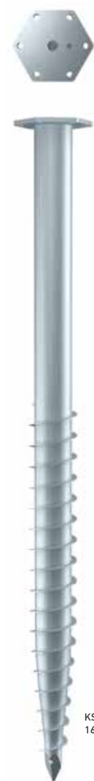
KSF M 89x 1600-M24