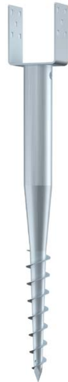
KSF U 66x 730-111

Screwing Bar short 0.60 kg Item No. 20070