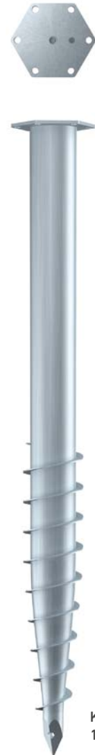
KSF M 76x 1000-M12