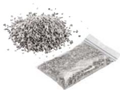
Special Granulate 500 g Item No. 21823