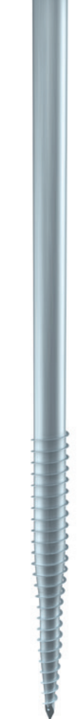
KSF M 140x3000-M24